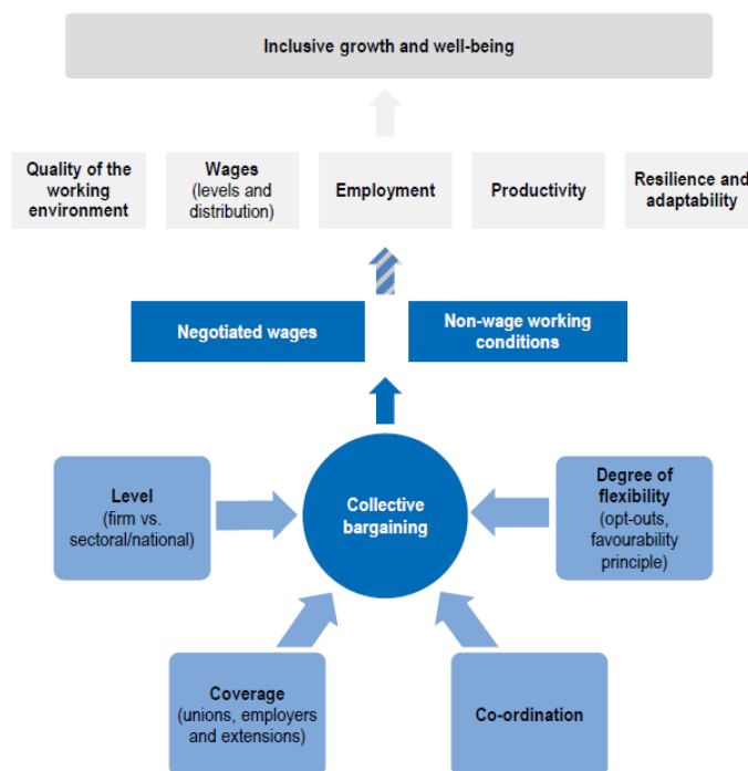
Figure 3.1. Collective bargaining, labour market performance and inclusive growth